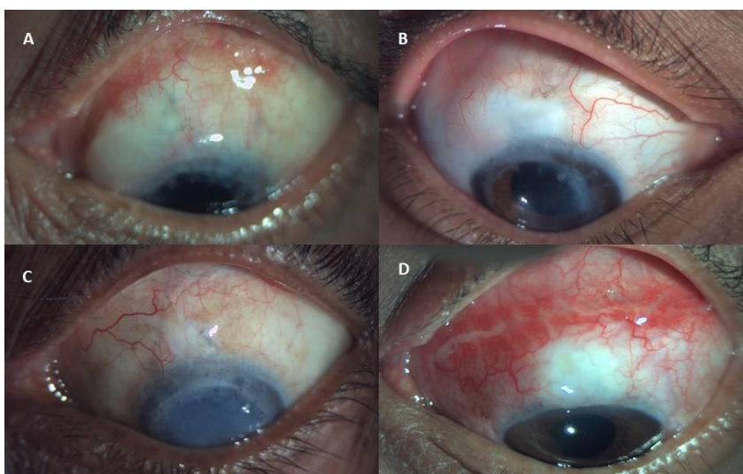
Fig. 2A: Large bleb post-operatively; B to D: Small bleb post-operatively