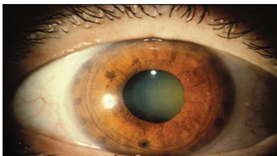
Fig. 1: ALPI marks placed one burn width apart

release or bubble formation occurred. Treatment consisted of 24 spots over 360 degrees of iris, placed at least one burn width apart and avoiding large visible radial vessels. (Fig. 1)