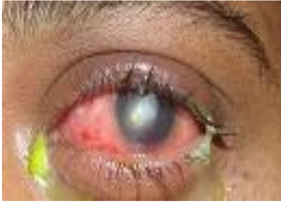
Fig. 1: Fungal corneal ulcer involving central cornea with Conjunctival congestion