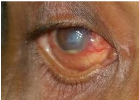
Fig. 2: Fungal corneal ulcer: Resolving stage with mild hypopyon