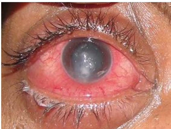
Fig. 3: Fungal corneal ulcer: corneal edema with bullae formation