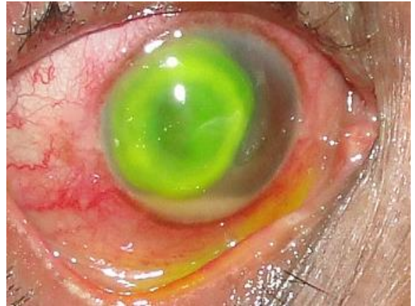
Fig. 4: Diffuse Fluorescein stain positive fungal corneal ulcer with hypopyon