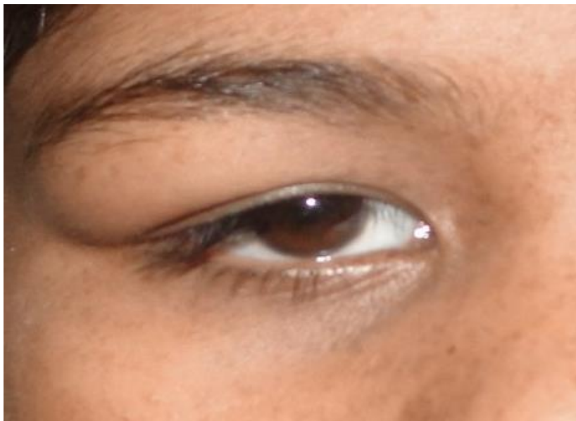
Figure 1: Clinical photograph showing mass around right upper eye lid leading to mild mechanical ptosis

Presence of at least 2 neurofibromas 4.atleast 2 Lich's nodules on iris .A diagnosis of NF 1 was confirmed in our patient.