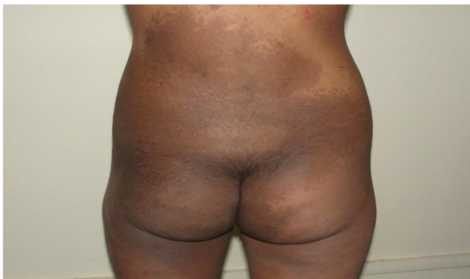
Figure 2: Clinical photograph showing multiple diffuse hyperpigmented macules.