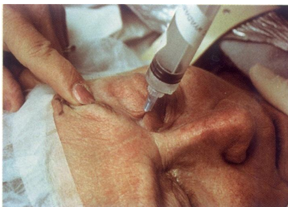
Fig. 1: Peribulbar Anaesthesia