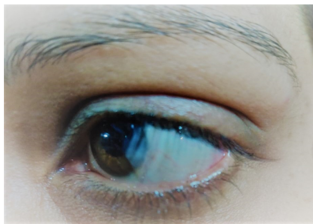
Figure 1: Clinical photograph of patient showing primary temporal pterygium