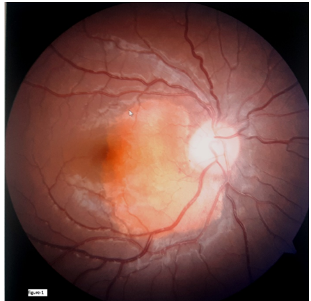
Fig. 1: Fundus photograph shows oval, irregularly elevated, yellow-white tumor between the optic disc and the macula of the right eye with irregular orange pigment clumps on the tumor surface. The size of the lesion was 2*6 disc diameters

Choroidal osteoma is a benign ocular tumour of unknown aetiology. Its first case was presented by Van Dyk at the Verhoeff society meeting in 1975 and reported by Gass 3 et al. The diagnosis of choroidal osteoma is mainly clinical. Majority of the cases remain asymptomatic and choroidal osteoma may be an incidental finding in a patient presenting with other complaints. Patients usually present with symptoms of blurred vision, metamorphopsia, 4 photophobia and visual field defects corresponding to the location of the tumor. It is usually unilateral in 75% of cases. 5 The most common age of presentation is in second or third decades of life and has predilection for young