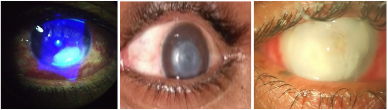
Fig. 1: Variable clinical presentation of bacterial keratitis

Redness and discharge were scored utilizing validated photographic standards. 7 Pain was scored according to the score give by Herr et al. as severe = 3, moderate = 2, mild = 1, absent = 0. 9 The size of the corneal ulcer and area of Infiltration was measured in square millimeters using Slit-lamp. Clinical and Microbiological assessment were performed at visit 1 (day 0) and repeated at visit 2 (day 7), visit 3 (day 14) and visit 4 (day 21).