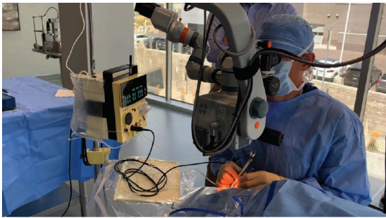
Fig. 2: Phaco machine and phacoemulsification procedure

Financial Interest) phaco machine by the same surgeon. The phaco parameters were kept constant for all cases wherein the power was 60%, the aspiration flow rate was 34 ml/ min, and vacuum 350 mm Hg.