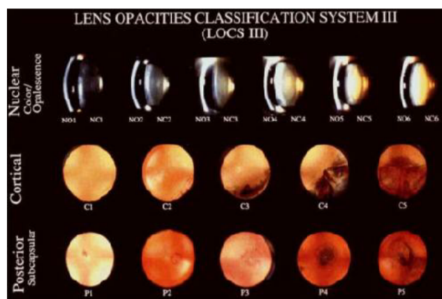
Fig. 1: LOCS grading

All patients after complete preoperative ophthalmological evaluation including visual acuity, ocular surface, extraocular and posterior segment evaluation underwent an evaluation for their grade of cataract on the basis of LOCS III (Lens Opacities Classification System) grading using slit lamp biomicroscope and were divided into 2 groups. 5