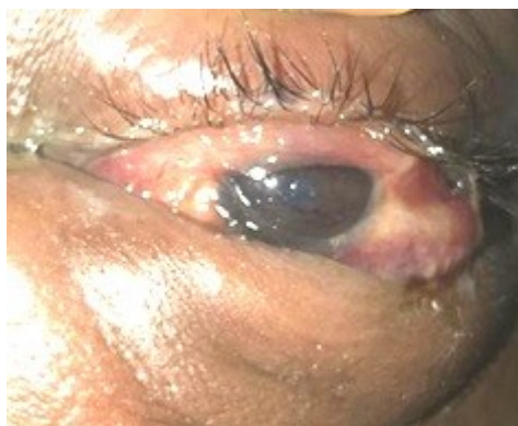
Fig. 1: Left eye lid edema, congestion, tense chemosis with proptosis

proptosis, and tense lid swelling slightly reduced but RAPD and limitation of extraocular movements remained the same. She also received intravenous corticosteroids to decrease inflammation and optic nerve compression. On 3rd day of presentation, a contrast-enhanced CT showed a possible extraconal abscess anteromedially with medial extraconal fat stranding in the left orbit. (Figure 2 b) On day 5 of presentation, culture reports of conjunctival swab yielded streptococcus pyogenes sensitive to ciprofloxacin, clindamycin, erythromycin, and penicillin. Since there was no significant improvement clinically with 5 days of empirical treatment, antibiotic was changed to intravenous ciprofloxacin. On day 7 of admission, the patient was taken up for left medial orbital decompression with drainage of extraconal abscess (0.5ml). Postoperatively there was marked reduction in proptosis, lid swelling and improvement of extraocular movements, however, grade 3 RAPD remained and vision progressively deteriorated to denying light perception. On follow-up, after 2 weeks the vision persisted to no light perception with grade 3 RAPD, and disc pallor. (Figure 3 a) There was resolution of proptosis and extraocular movements completely improved with residual left exotropia. (Figure 3 b) Repeat imaging showed thickened optic nerve with no evidence of any residual disease at 2 weeks (Figure 2 c) whereas imaging done at 3 months showed normal findings. (Figure 2 d)