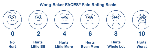
Fig. 1: Wong-Baker FACES Pain Rating Scale 20

Pain rating scale was graded as follows: