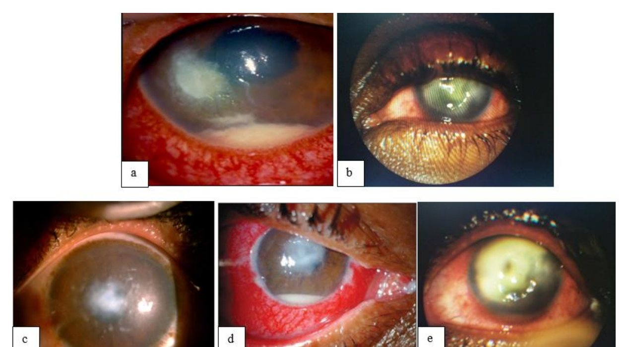
Fig. 2: Clinical photograph showing Fungal keratitis caused by (a): Aspergillus flavus; (b): Aspergillus niger; (c): Aspergillus fumigatus; (d): Fusarium spp; (e): Phaeoid