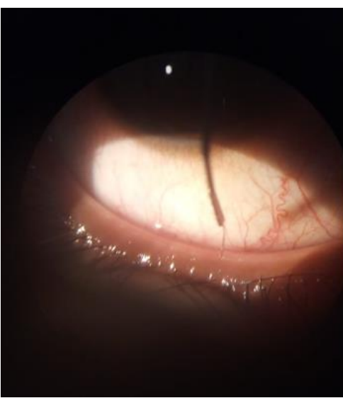
Fig. 2: Showing the meibomian gland probe being passed through the meibomian orifice