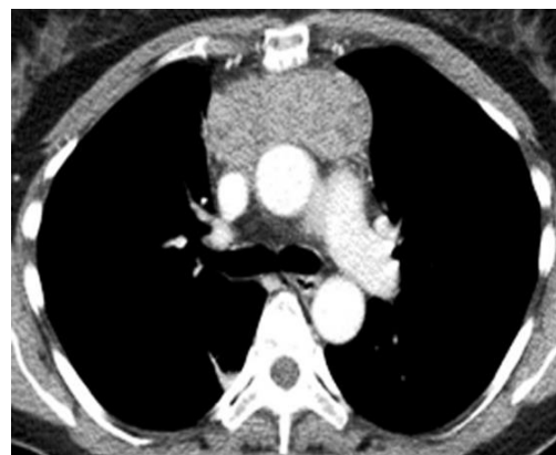
Fig. 3: CT scan of thymoma