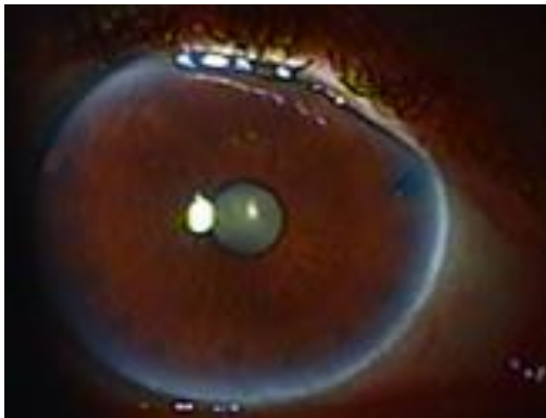
Fig. 2: Irido trabecular contact relieved after LPI plus ALPI

In present series, the ITC of appositional closure type was relieved in 75% cases in LPI group and 88% cases in LPI plus ALPI group. It was due to correction of the plateau iris after laser iridoplasty done in group B. As per Liwan eye study, residual iridotrabecular contact is present in as high as 59% cases even after a successful LPI. In such cases, argon laser peripheral iridoplasty has been found to be effective by tissue contraction resulting in pulling of the peripheral iris away from the trabecular meshwork, thereby opening the anterior chamber angle. 11 Ritch and associates have described the mechanism of relieve of crowding in laser iridoplasty. Laser iridoplasty thins out the peripheral iris stroma thereby creating space in angle recess 12 . It is evident from the present study and other studies 12-15 that nearly 60% of the cases of PAC have residual iridotrabecular contact after LPI which may be due to PAS, plateau iris configuration or other mechanisms such as antero placement of the lens or anterior rotation of ciliary process. Addition of iridoplasty to LPI can relieve plateau iris configuration and thereby increase the success in terms of relieving ITC and lowering IOP. (Fig. 2)