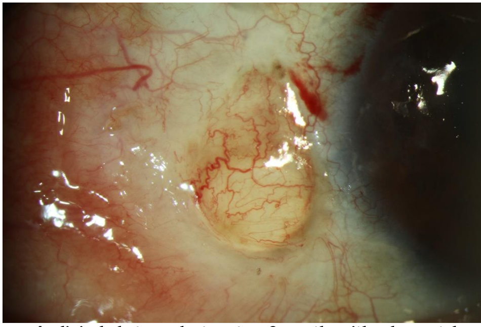
Figure 4: clinical photograph at post op 2 months with sclera patch graft and autoconjunctival tissue well attached