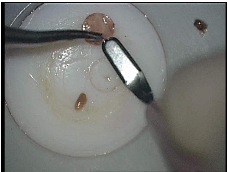
Figure 2: preparation of lamellar micro scleral patch graft