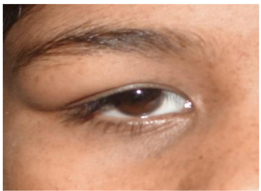
Figure 1: Clinical photograph showing mass around right upper eye lid leading to mild mechanical ptosis

Presence of atleast 2 neurofibromas 4.atleast 2 Lich's nodules on iris .A diagnosis of NF 1 was confirmed in our patient.