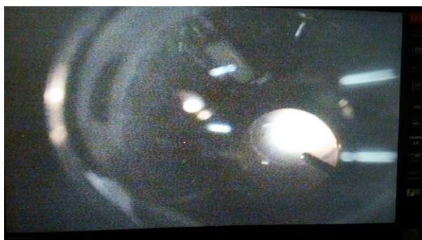
Dislocated cataractous lens