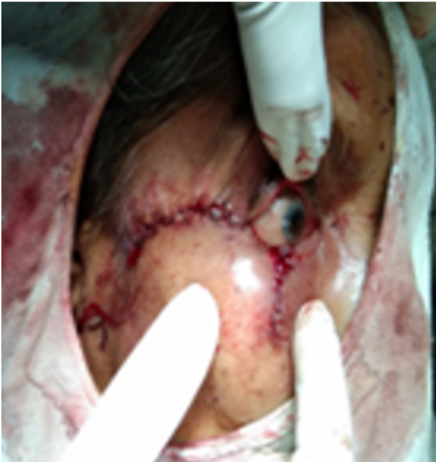
Fig. 2: Lid reconstruction was done by Tansel flap technique

Follow up on 1 st , 7 th , 30 th day and 6 month revealed no complication or recurrence. Biopsy revealed presence of large hyperchromatic neoplastic cells with vacuolated basophilic cytoplasm. 1 The IHC report came positive for cytokeratin 7 and negative for cytokeratin20, CD10 and Vimentin. There is 3%-5% of KI67 positivity indicating its invasiveness. The final diagnosis came out to be sebaceous gland carcinoma of eyelid.