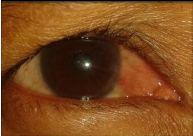
Fig. 2: Recurrence following pterygium surgery