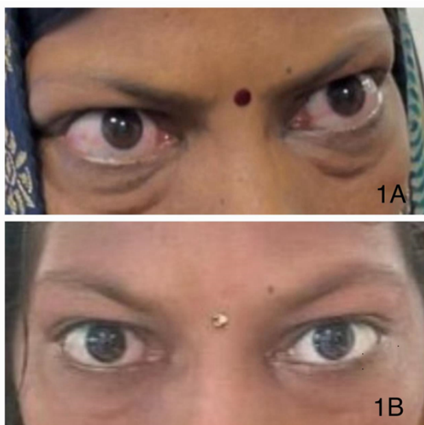
Figure 1: A) Baseline clinical activity score (CAS, 4/10); B): Clinical activity score (CAS, 0/10) after 3 month of Methylprednisolone therapy

in outstretched hands was present. Sexual maturity rating according to Tanner stage was 1 for breast and pubic hair. Ophthalmological examination revealed retracted eyelid, and lagophthalmos. Exophthalmos measurement by Hertel ophthalmometer on the right and left sides were 20 mm and 16mm, visual acuity with Snellen's chart was 6/18 in both eyes. Intraocular pressure was normal. Clinical activity score (CAS) was 4 with redness and swelling of the eyelid, caruncle swelling and pain while movement (Figure 1 A). Systemic examination was otherwise normal.